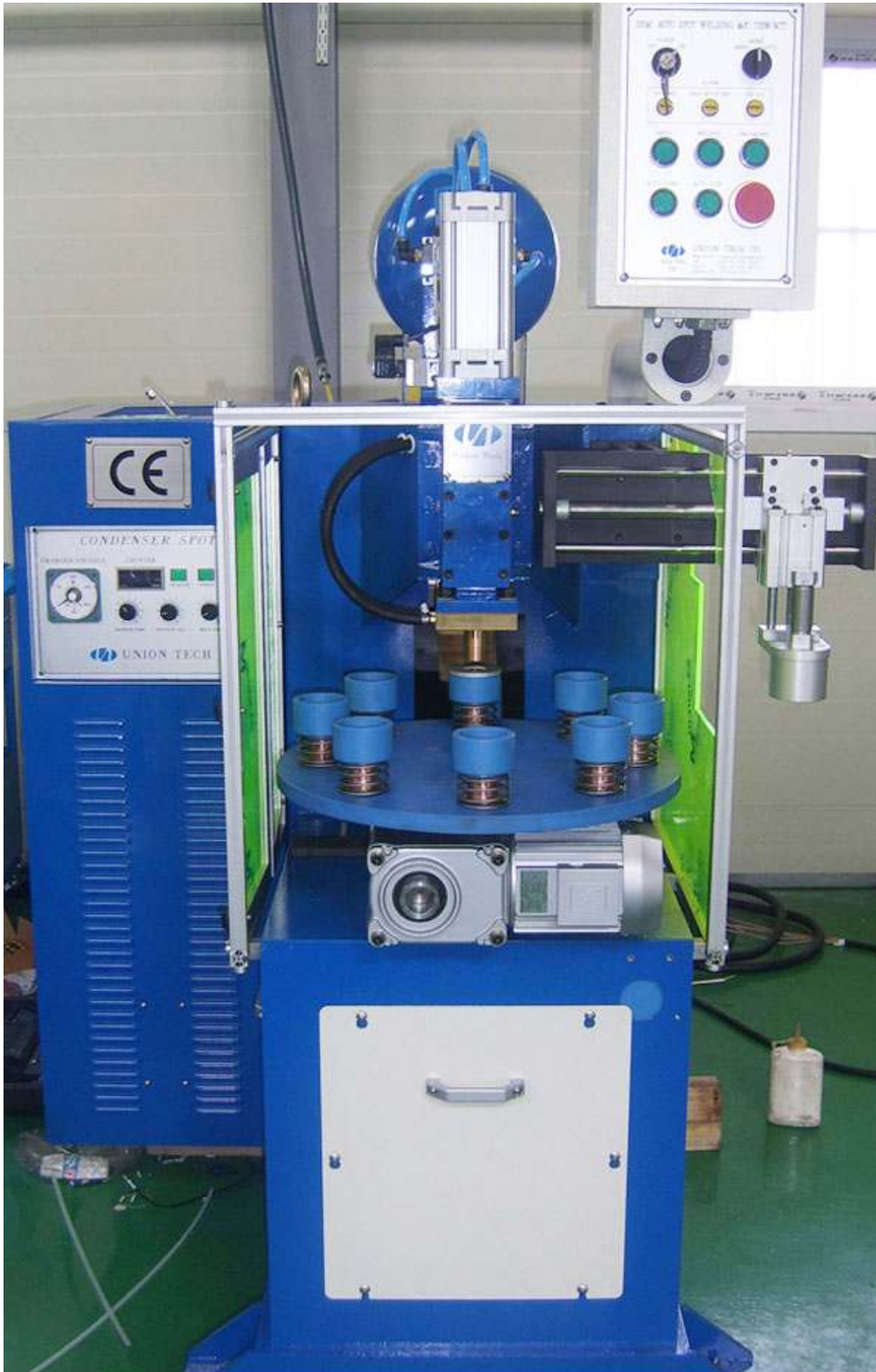
M/C MAIN PART