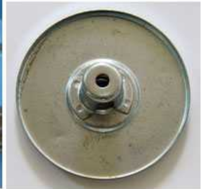
WELDING JIG PART