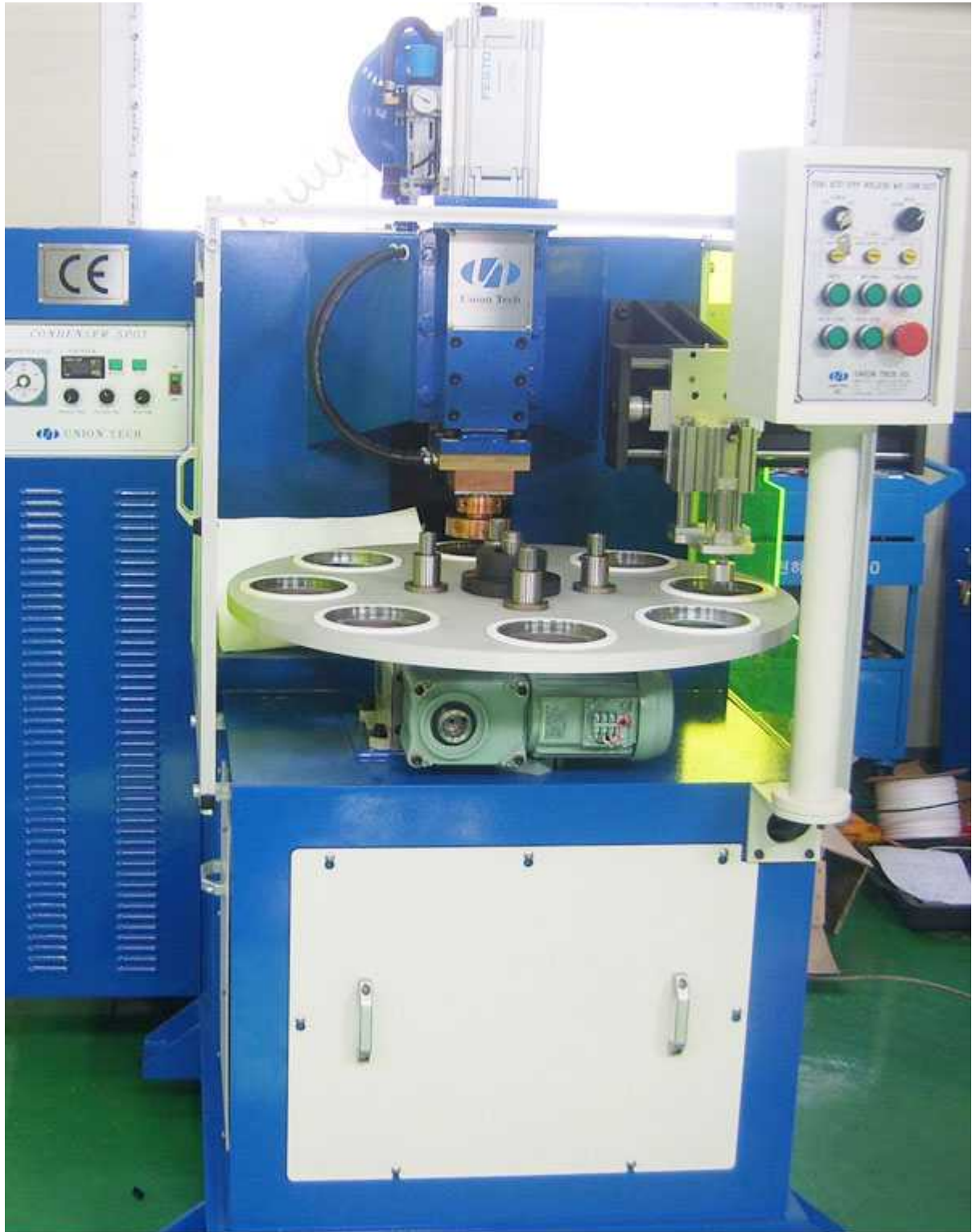
M/C MAIN PART