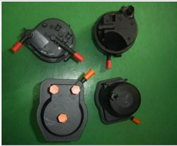
PLASTIC FUEL FILTER