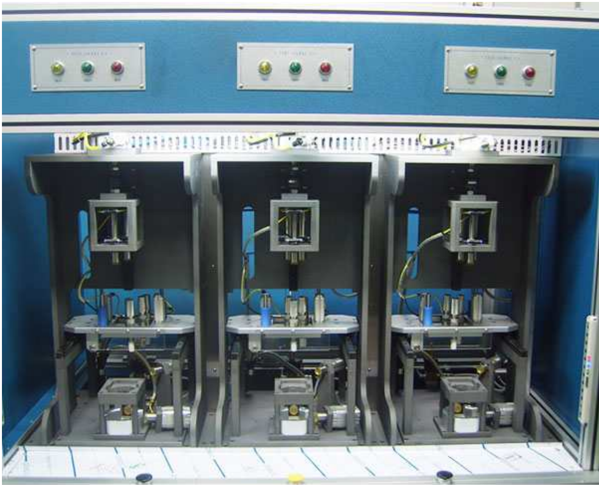
M/C MAIN PART 2