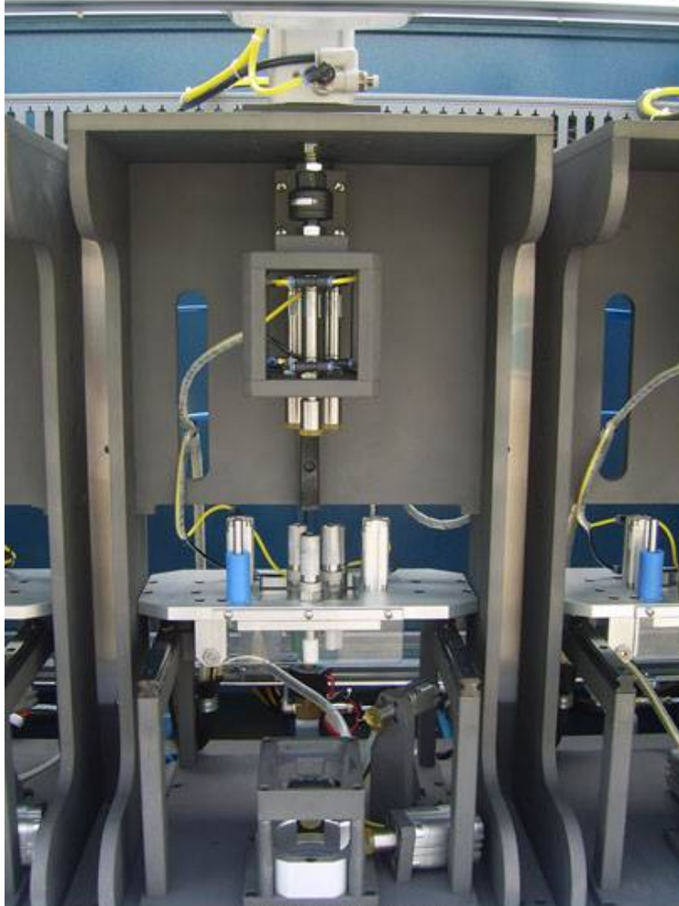
MAIN TESTING ZONE