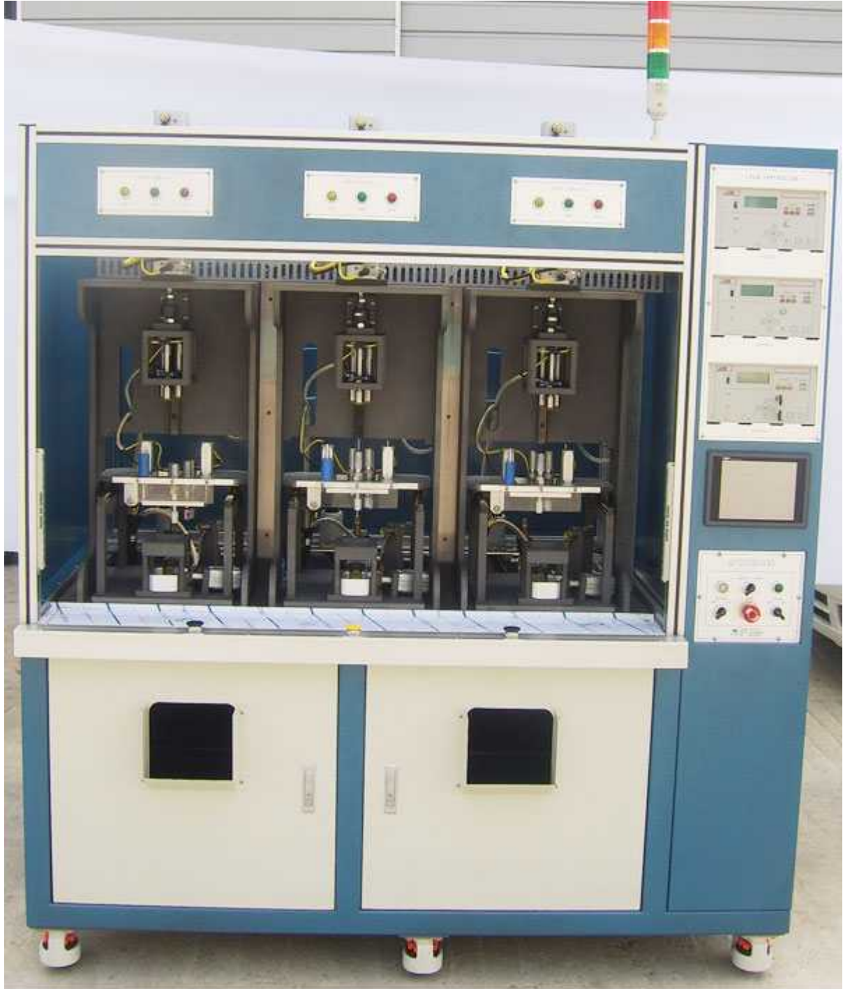
M/C MAIN PART 1