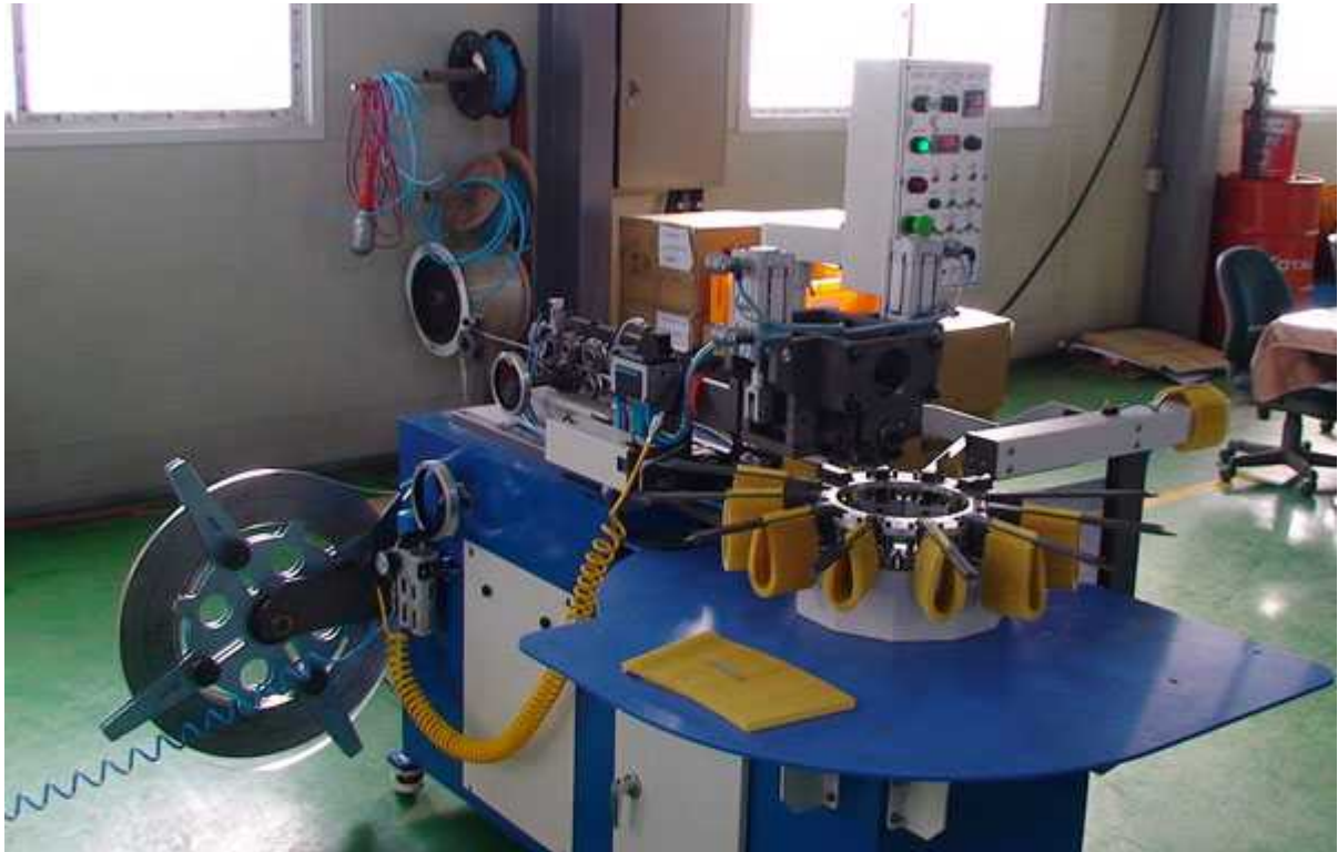
MAIN M/C PHOTO