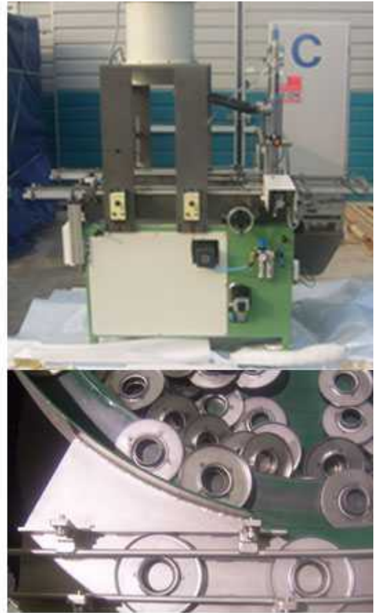
Main PVC Sol Dispenser M/C Photo with Auto Loading Parts Feeding Device