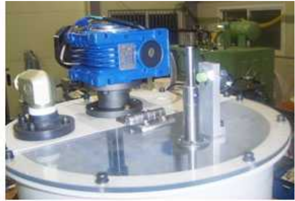
PVC SOL STORAGE & MIXING TANK