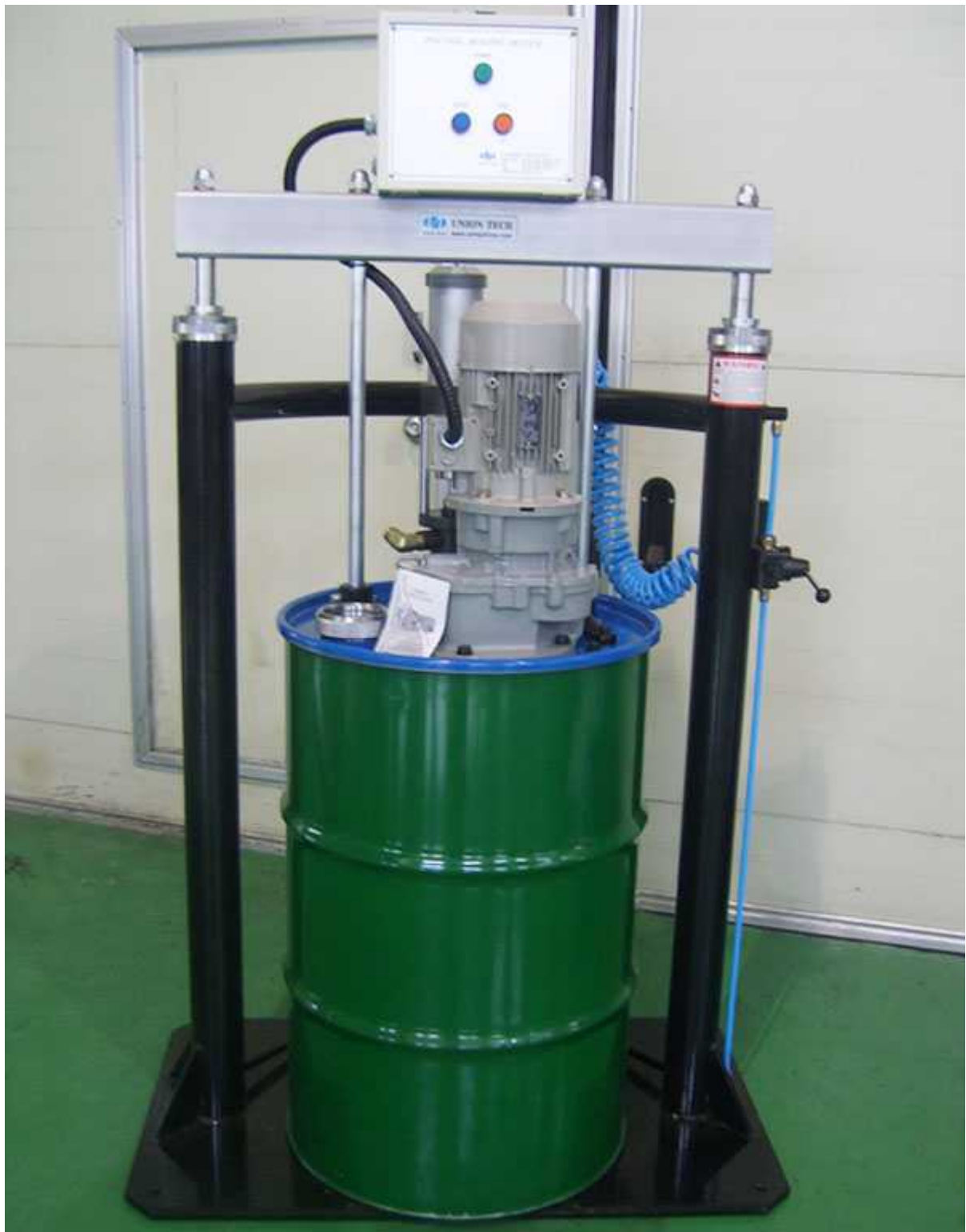
PVC SOL MIXING DEVICE