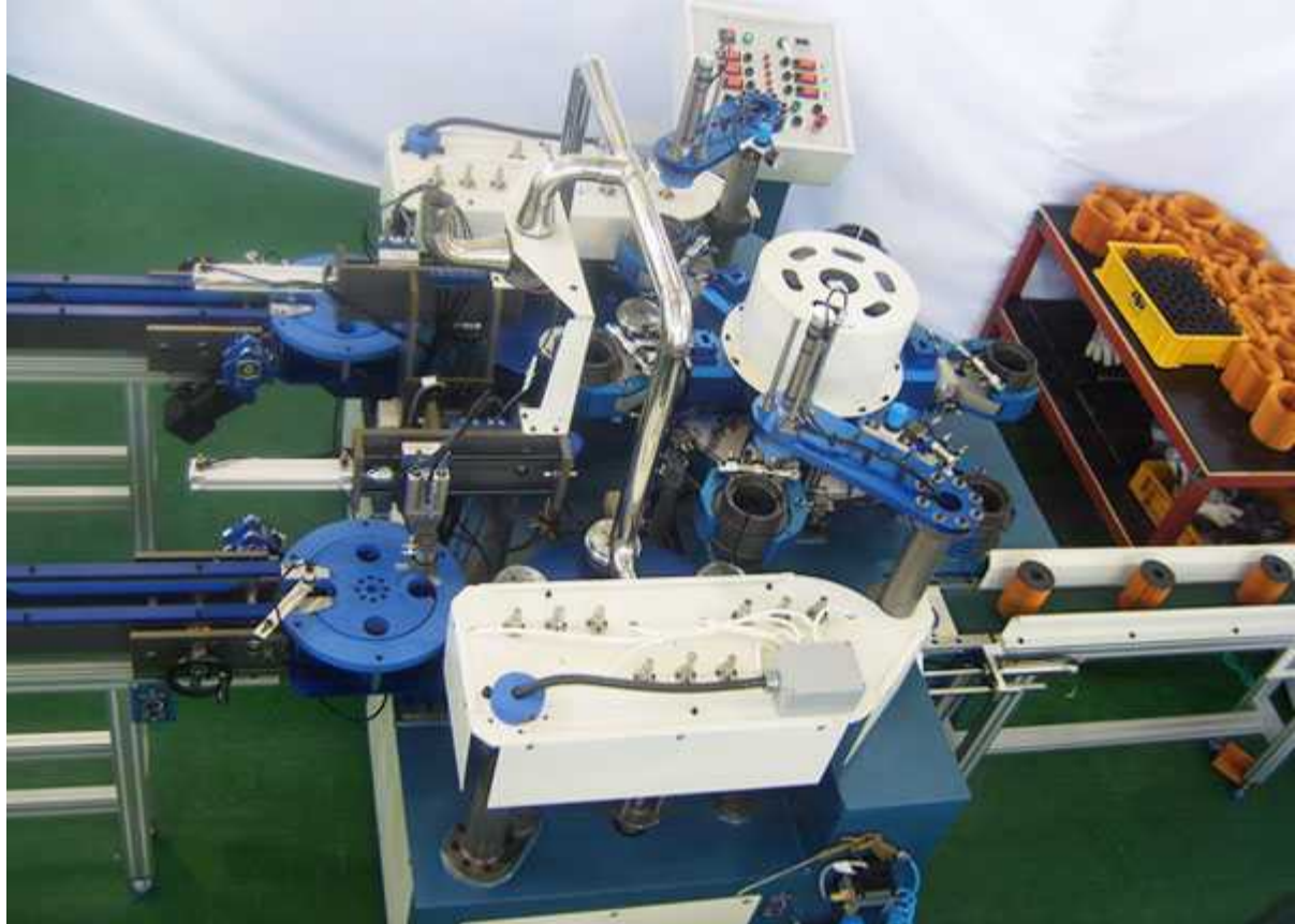
M/C MAIN PART