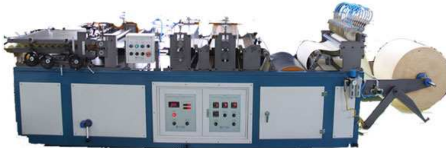
MAIN M/C PHOTO