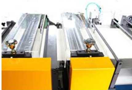
MAIN PLEATING ROLLER